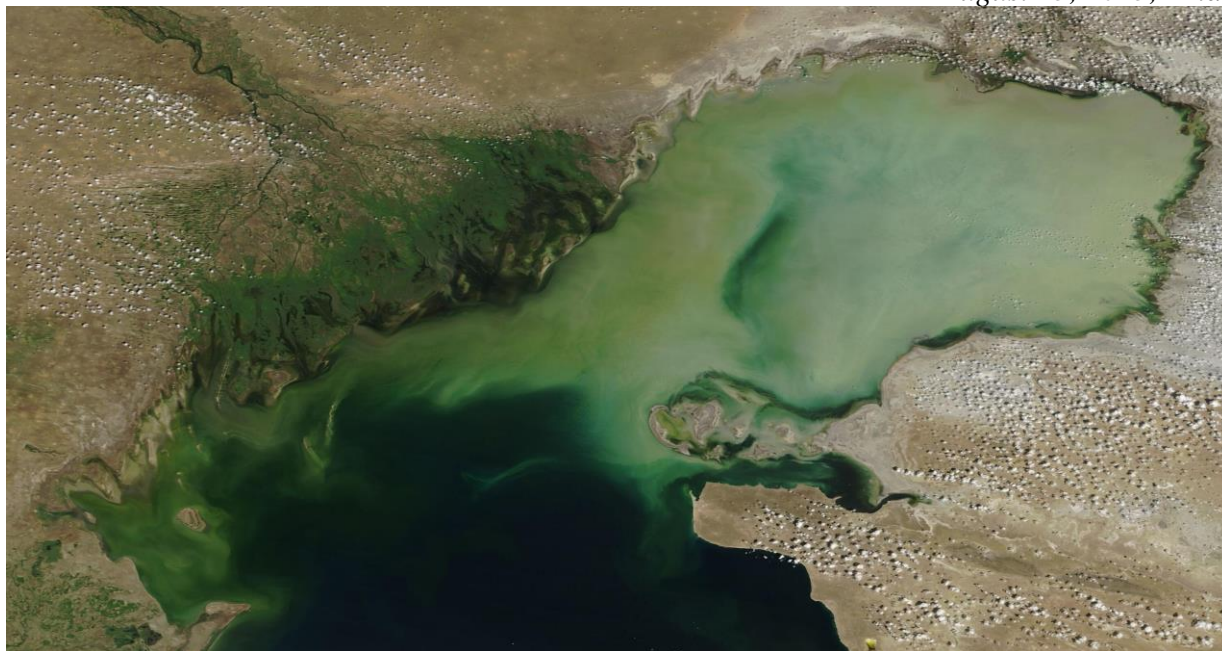
Fig.1 Space image of the Caspian Sea, August 14, 2025

In the period on August 14 – 19, the sea level is expected to fluctuate around the mark of minus 29.43 m BS. The range of fluctuations in sea level is from minus 29.08 m to minus 29.77 m.