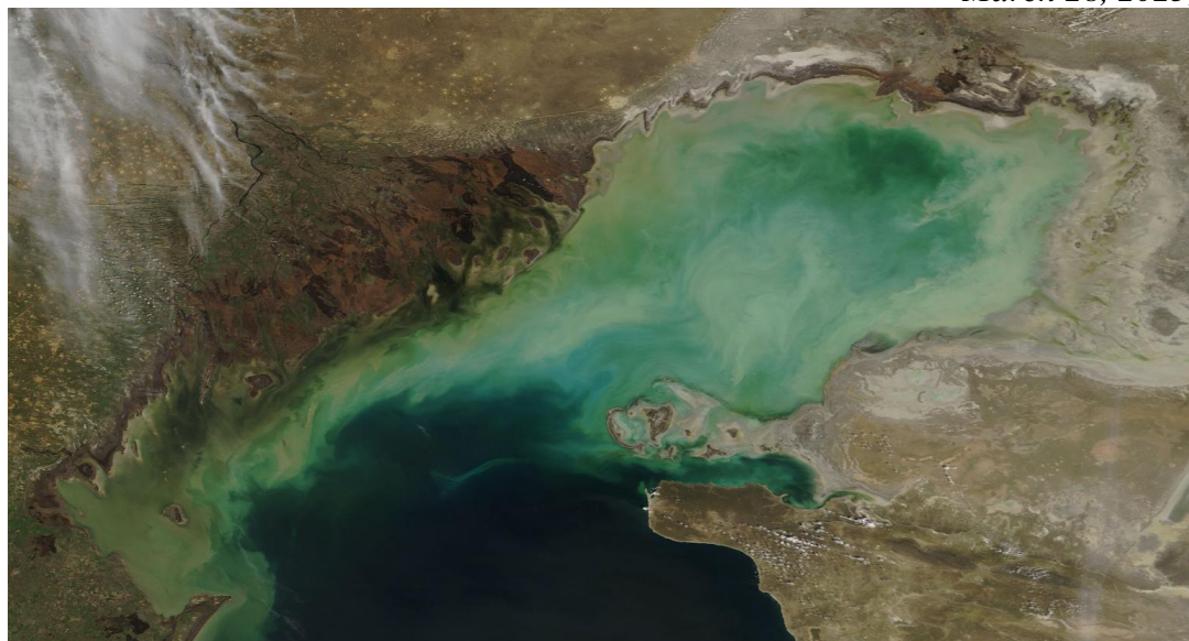
Fig.1 Space image of the Caspian Sea, March 26, 2025

In the period on March 27 – April 01, the sea level is expected to fluctuate around the mark of minus 29.47 m BS. The range of fluctuations in sea level is from minus 29.03 m to minus 29.77 m.