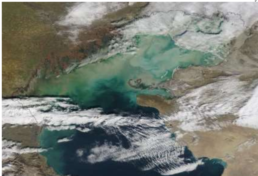
Fig.1 NASA/GSFC space images of the Caspian Sea, January, 1, 2024