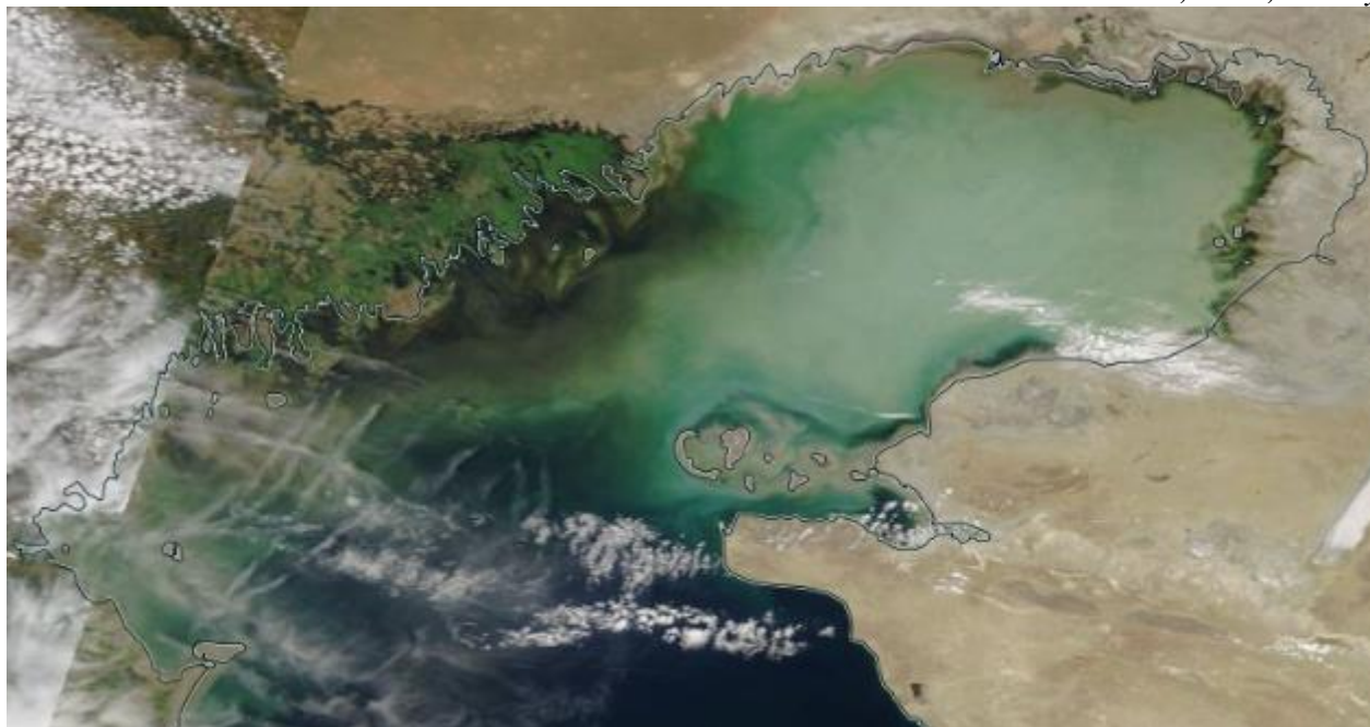
Fig.1 Space image of the Caspian Sea, June 04, 2026 (NASA/GSFC)